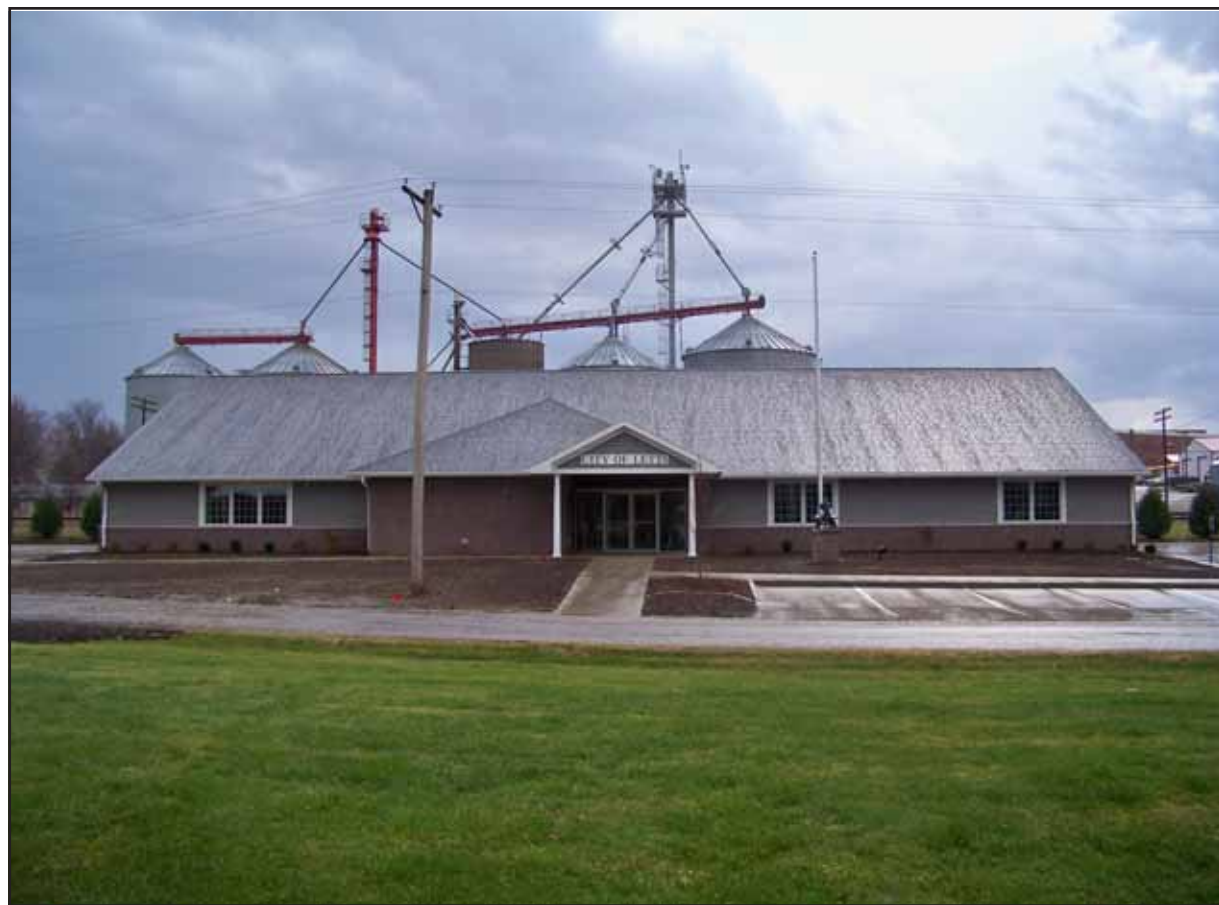
draws near. Congratulations to everyone in the city of Letts for their determination in making this dream become a reality that will be enjoyed by many generations that follow.

A grand opening is scheduled for Saturday, December 11th. More will be reported in the Gazette as the date